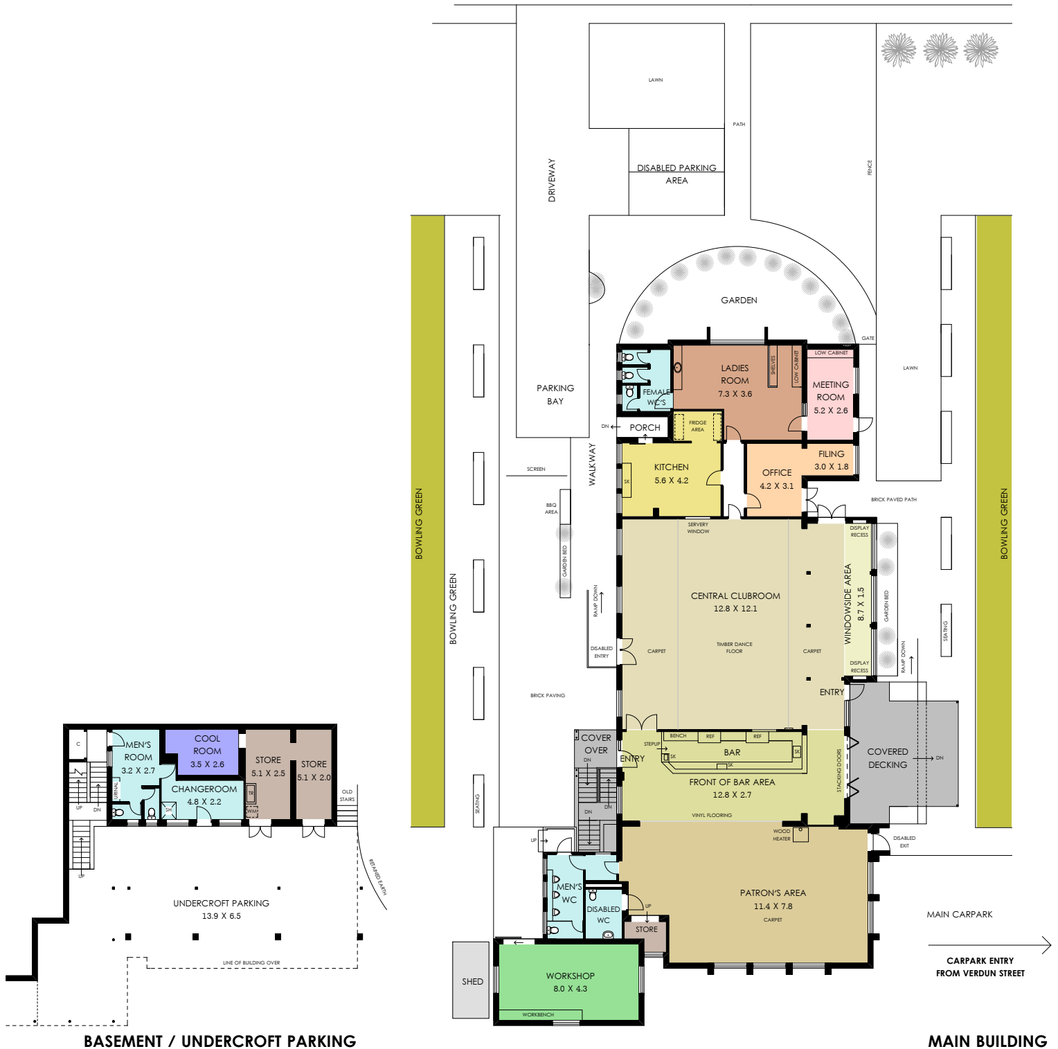
BASEMENT / UNDERCROFT PARKING